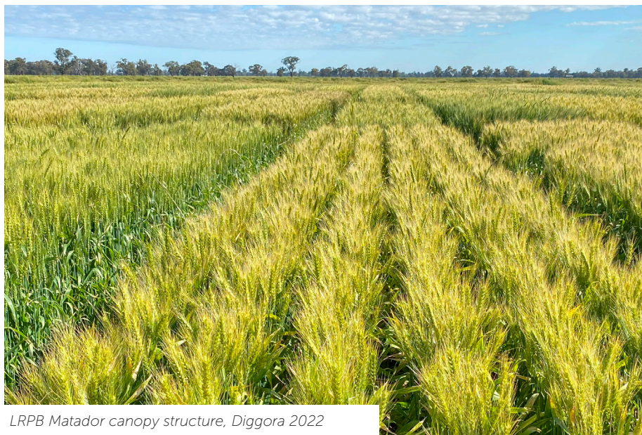
LRPB Matador canopy structure, Diggora 2022